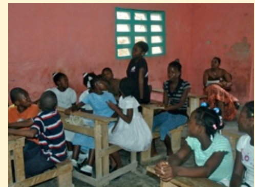
Teachers and Students of St. Joseph School